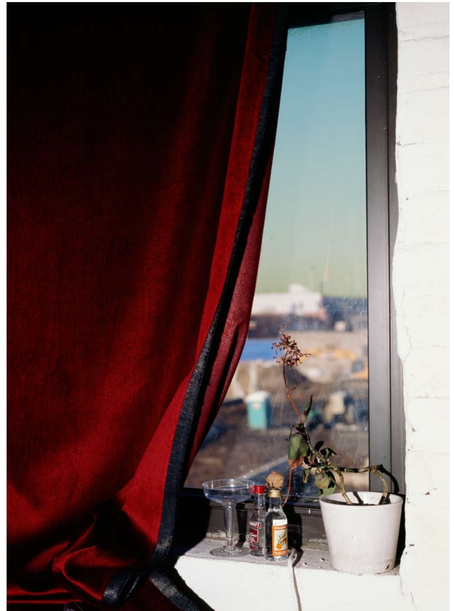
Colby Bird, Theatre , 2008, c-print, 104 x 127 cm

Onorato and Krebs also make sculptures – most recently for their Summer 2008 show at Swiss Institute, New York, where they exhibited the products of an upstate sojourn. Yet even when displayed in a gallery context, their objects' provisional, prop-like qualities allude to the photographic half of their practice. Like Bird, the artists have built a highly specific, interdisciplinary language to address some of the dominant narratives of our time, and through photography have appended them with small, personal and often irreverent accounts.